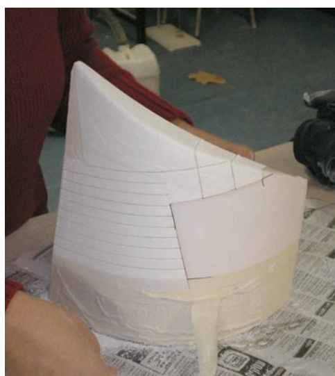
5 Removing the tape before firing