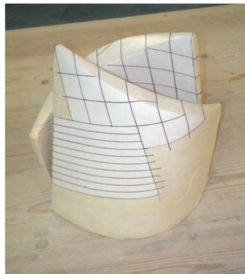
3 Object with design and covered areas