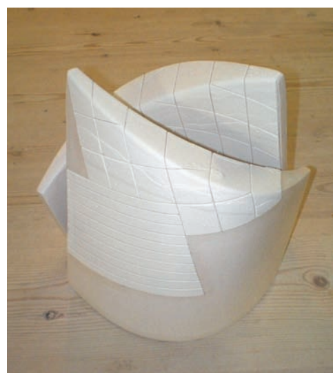
6 Object is ready for raku firing