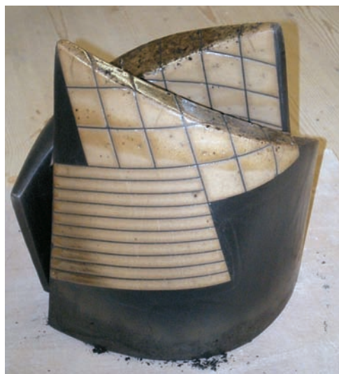
7 Object after raku firing