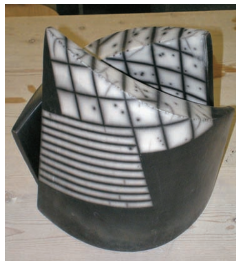
9 Final result after washing off the slip layer