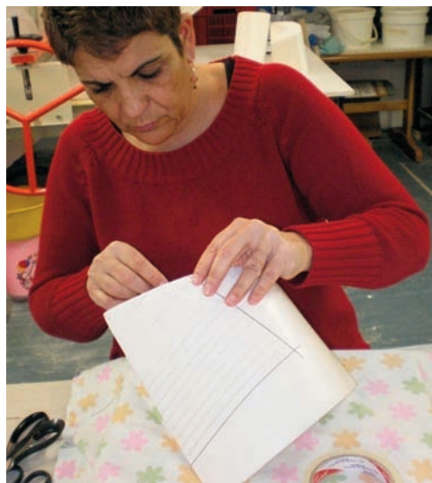
2 Applying tape to the design