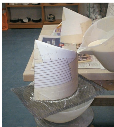
4 A layer of slip being added