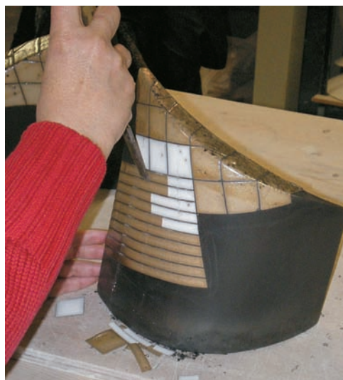
8 Peeling off the glaze layer